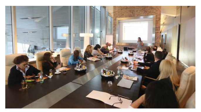
2014 Capacity-Building Workshop in Munich, Germany