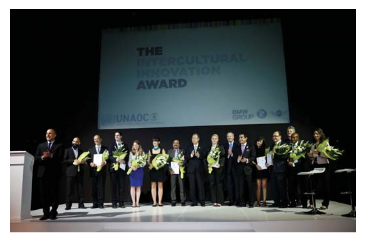
2014 Award Ceremony in Bali, Indonesia

Projects that have been submitted to previous editions of the Intercultural Innovation Award and were not selected are eligible and encouraged to apply again. However, organizations that have previously received any UNAOC support are not eligible to apply.